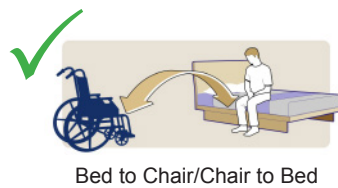
Bed to Chair/Chair to Bed