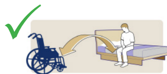
Bed to Chair/Chair to Bed (From/to seated position)